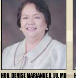
Board Member - District II